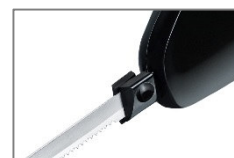
blades with finger guards