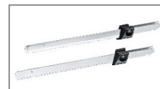
2 sets of blades for flexible usage