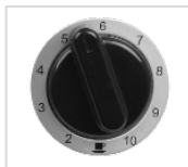
grinding up to 10 doses at a time