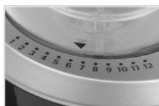
coarseness setting in 12 levels