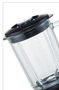
stable glass jug 1.8 l contents