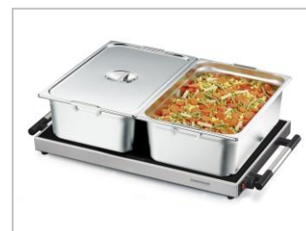
Fits food containers in gastro norm format